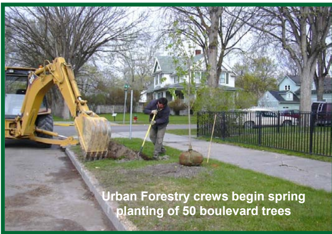
Urban Forestry crews begin spring planting of 50 boulevard trees

Did you know that Kalispell has a community garden in which residents of the area can grow their own vegetables for free ? It's true! The garden is located at the intersection of Liberty and Hawthorne Streets off of North Meridian. For information on how you can get a plot please call The Montana Conservation Corp at 755-3629 or Kalispell Parks & Recreation, 758-7715.